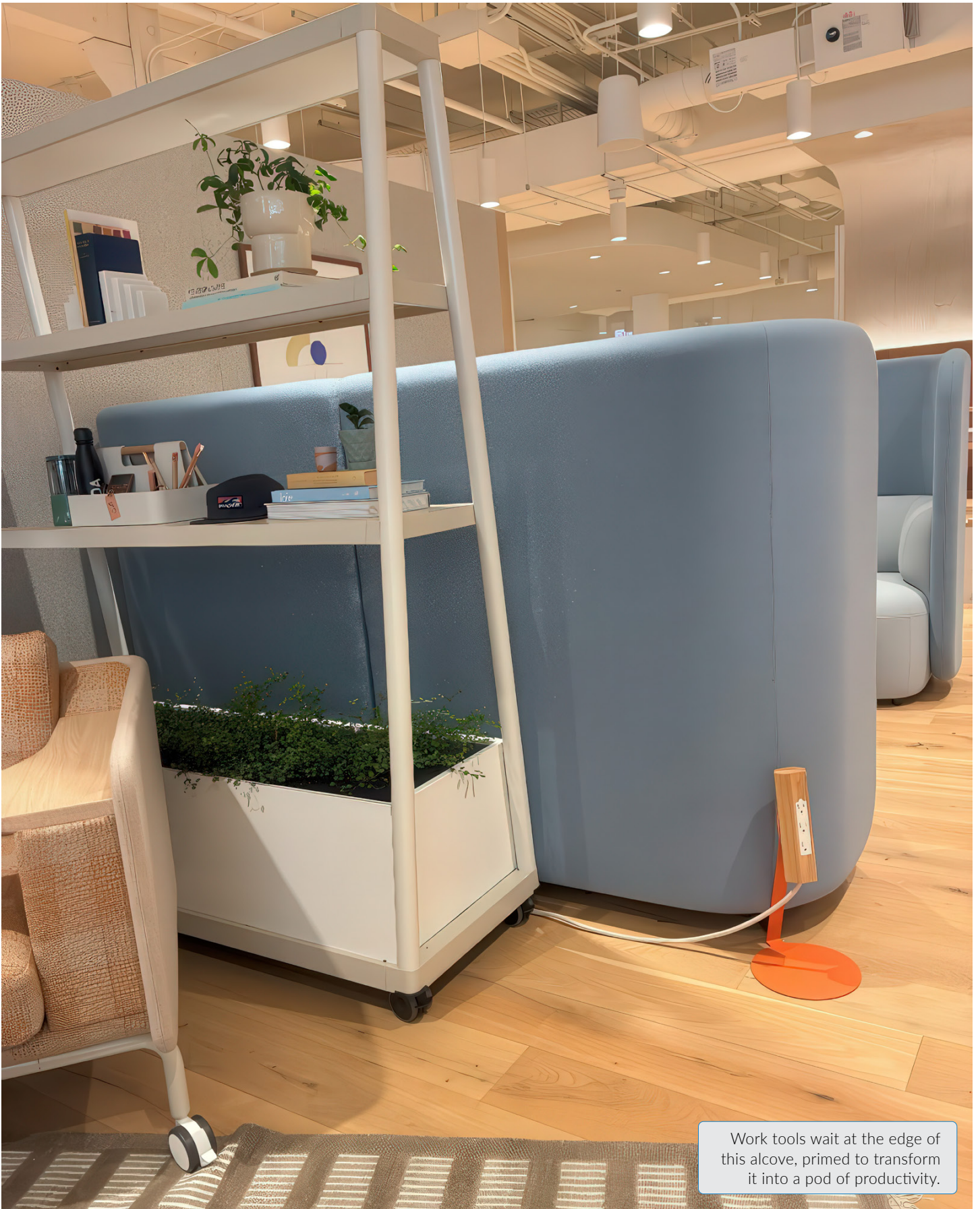
Work tools wait at the edge of this alcove, primed to transform it into a pod of productivity.