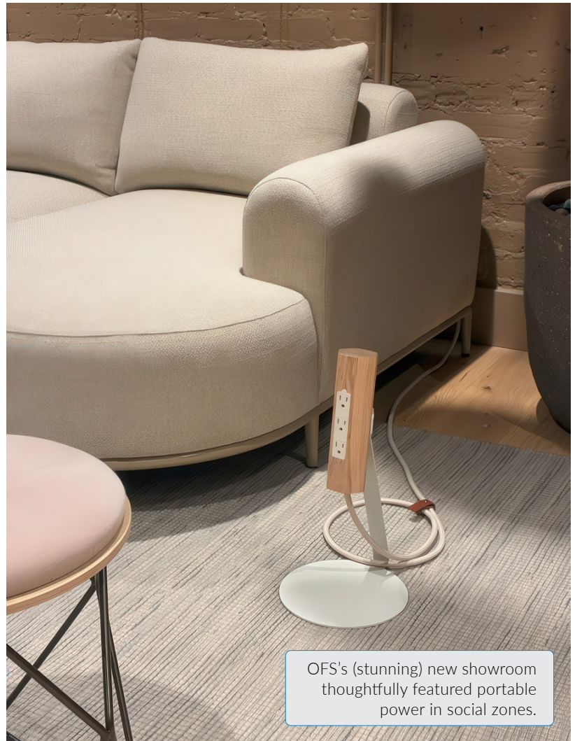
OFS's (stunning) new showroom thoughtfully featured portable power in social zones.

Office accessories do more than “decorate”—they define how a space works. Wheeled carts, caddies, and wall-mounted storage solutions keep