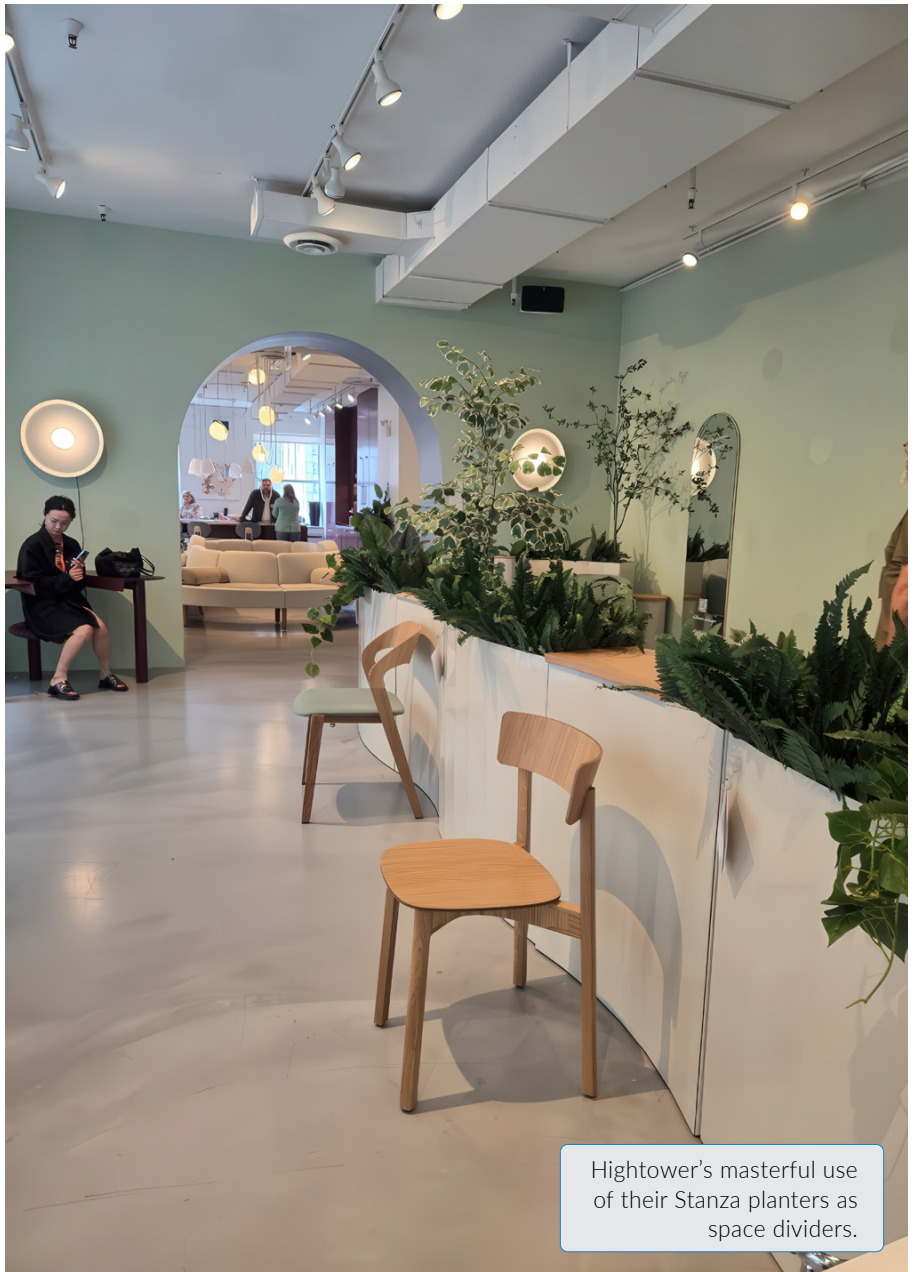
Hightower's masterful use of their Stanza planters as space dividers.

Planters—especially modular, mobile ones—double as space dividers, visual anchors, and wellness boosters. Whether perched on a windowsill, placed in a breakout area, or used to frame quiet zones, greenery softens the work environment and brings calm to the chaos of the day.