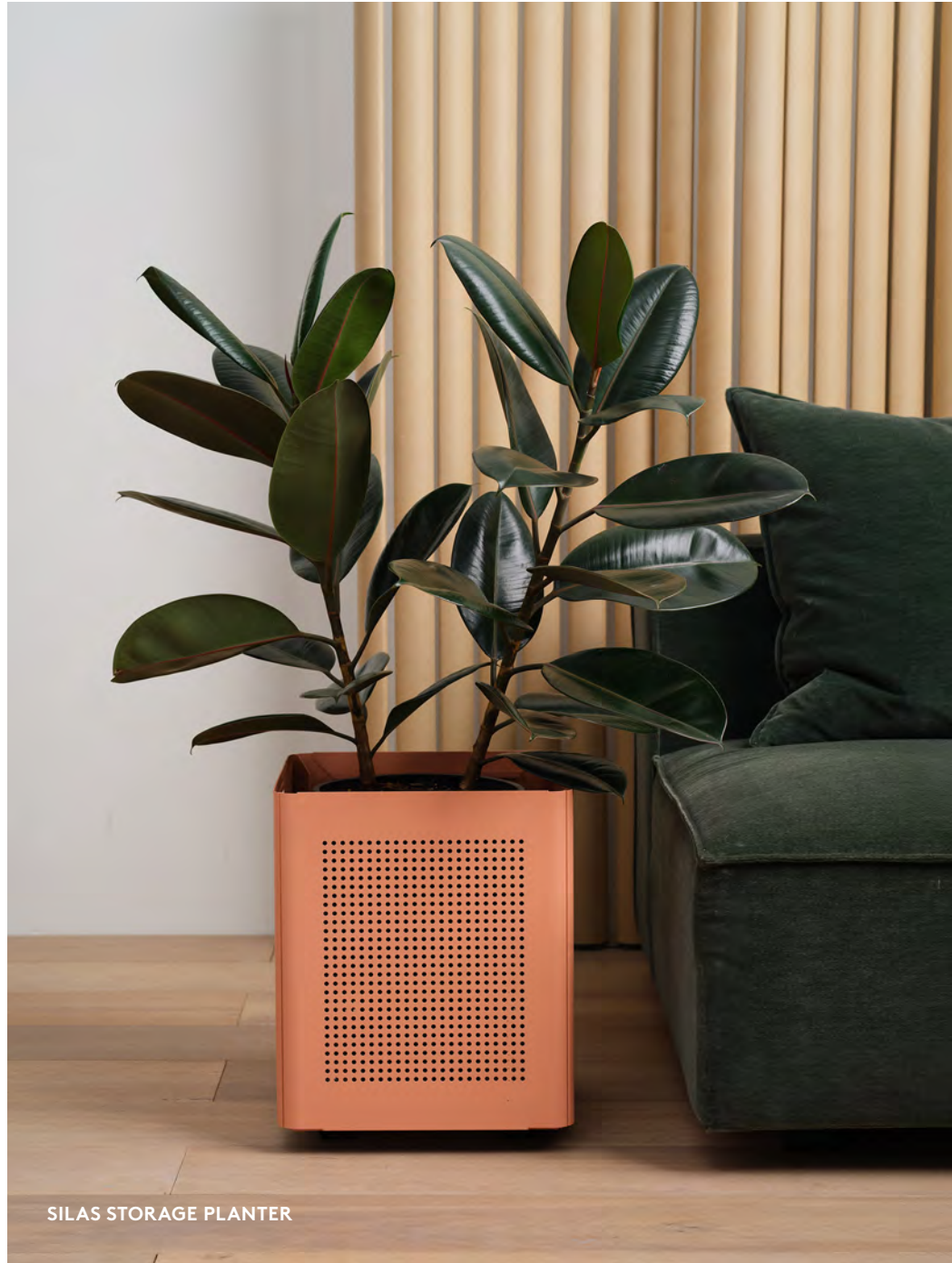
SILAS STORAGE PLANTER