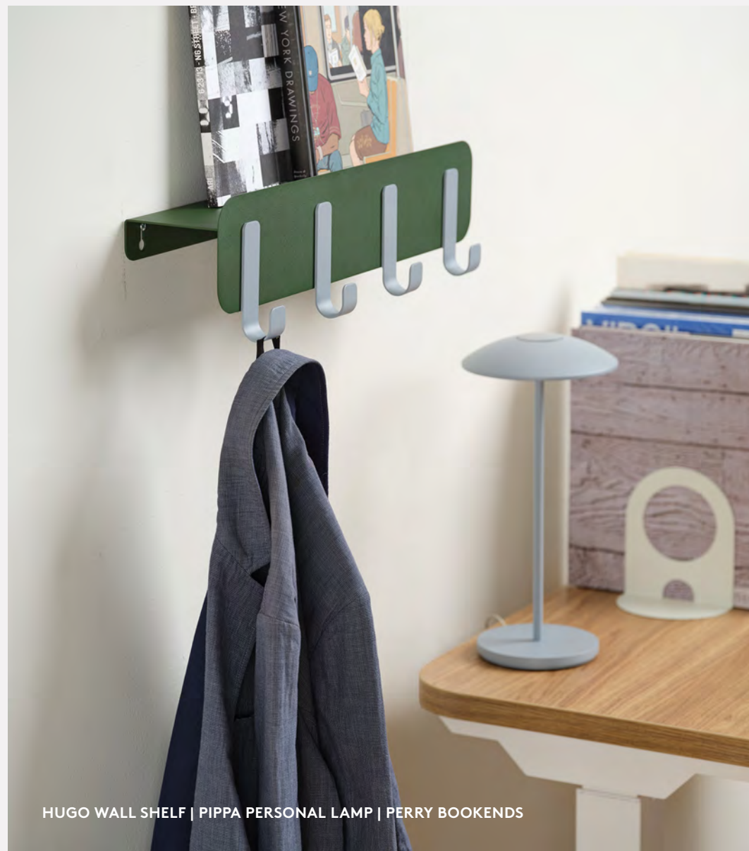
HUGO WALL SHELF | PIPPA PERSONAL LAMP | PERRY BOOKENDS