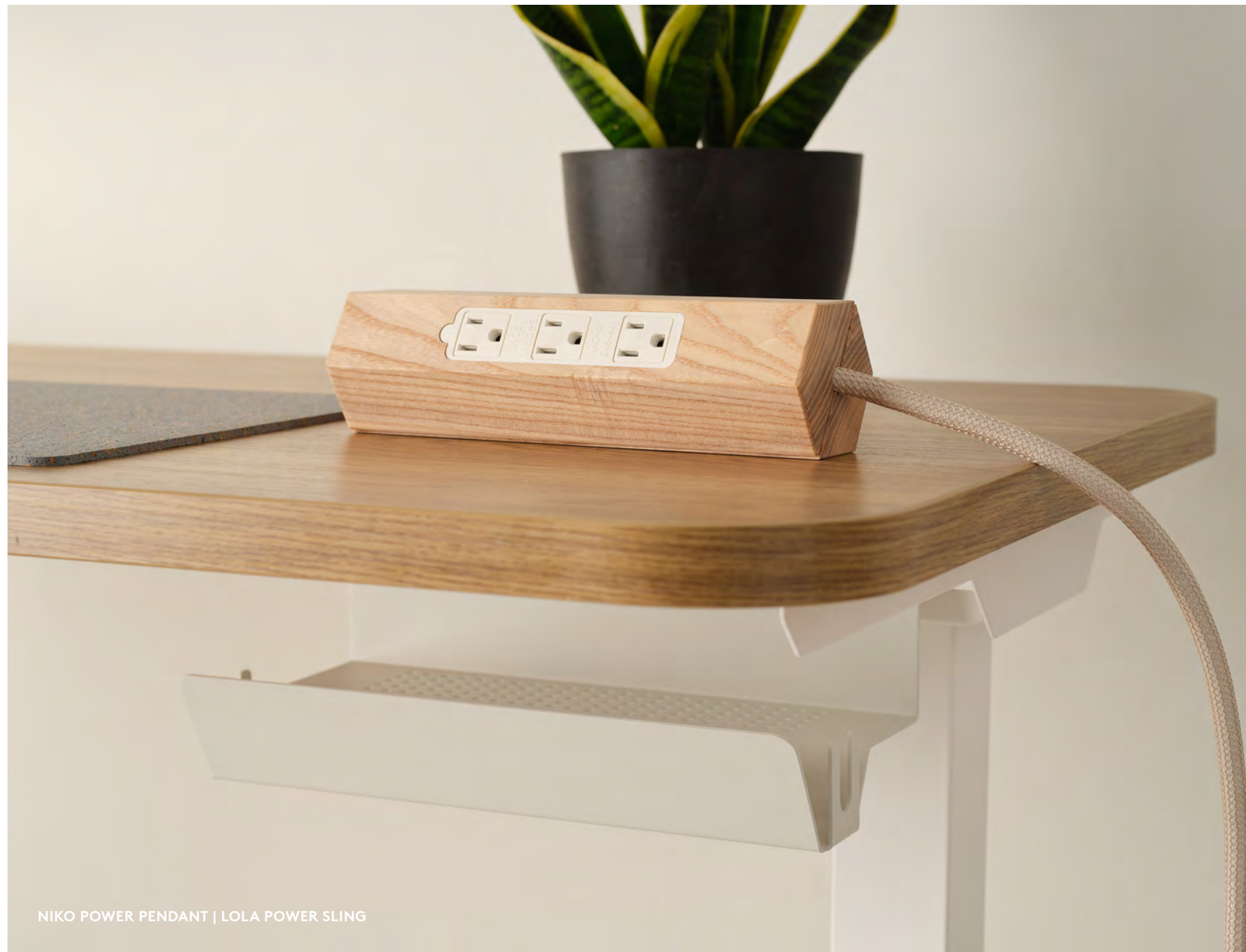
NIKO POWER PENDANT | LOLA POWER SLING