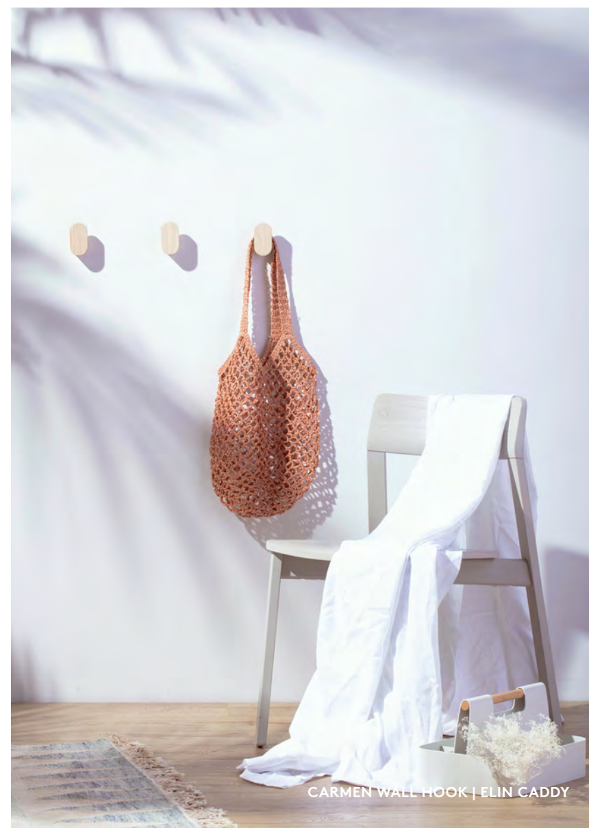
CARMEN WALL HOOK | ELIN CADDY