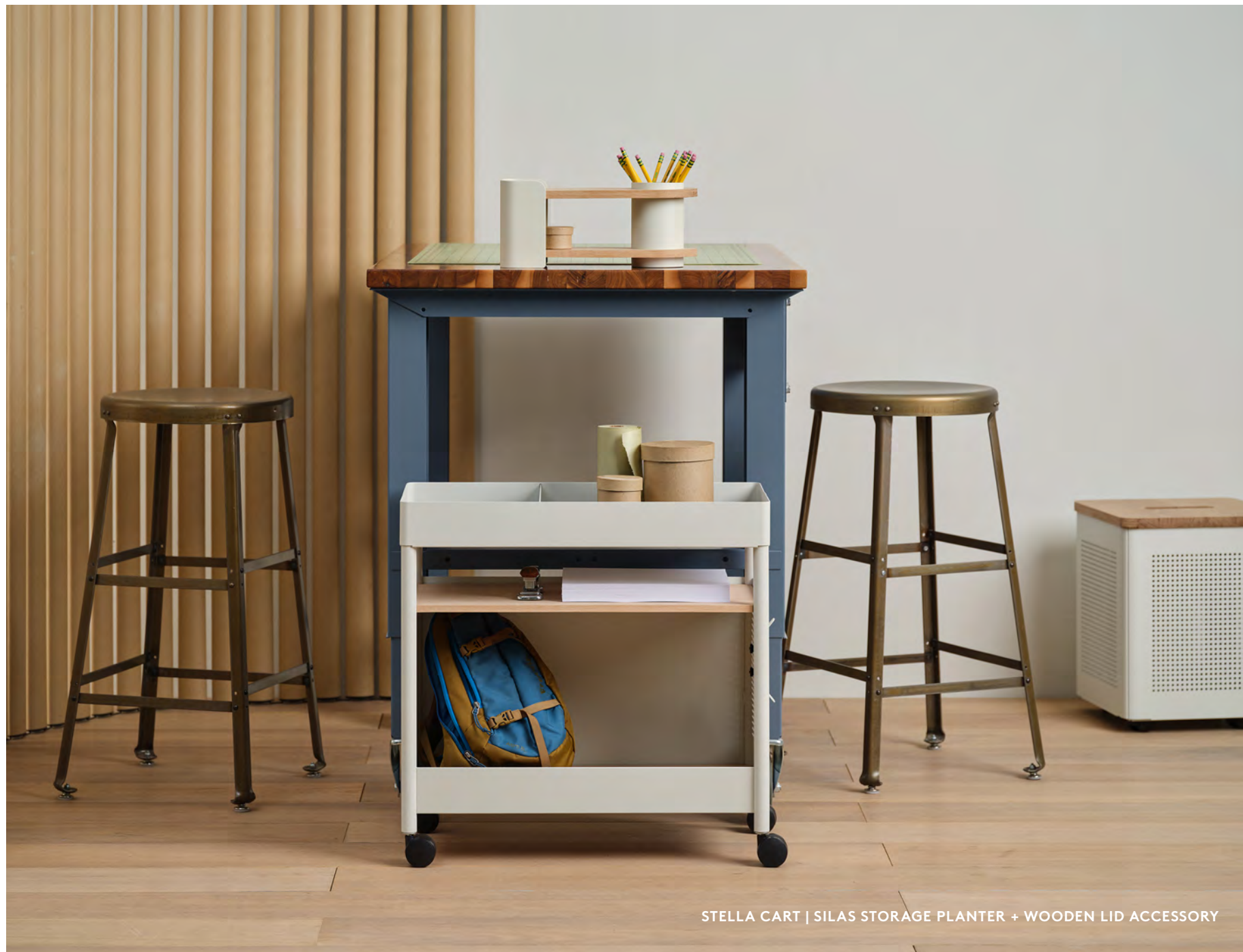
STELLA CART | SILAS STORAGE PLANTER + WOODEN LID ACCESSORY