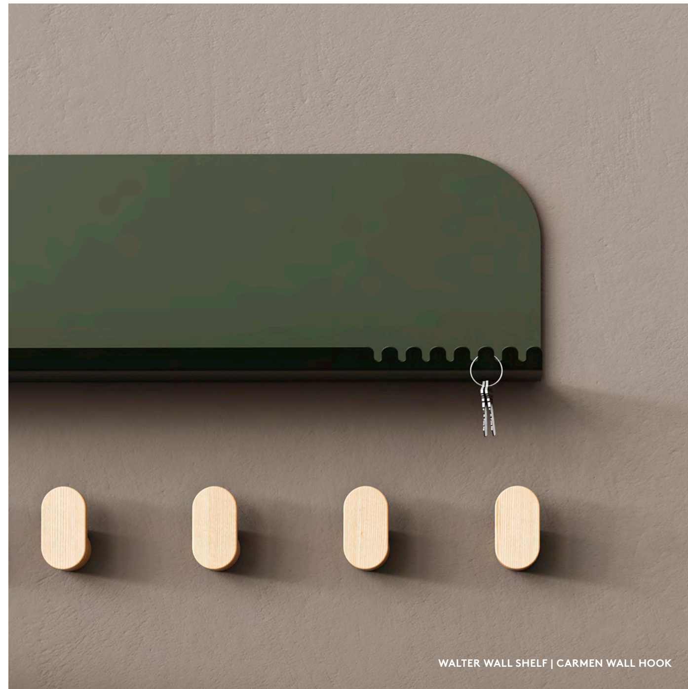
WALTER WALL SHELF | CARMEN WALL HOOK