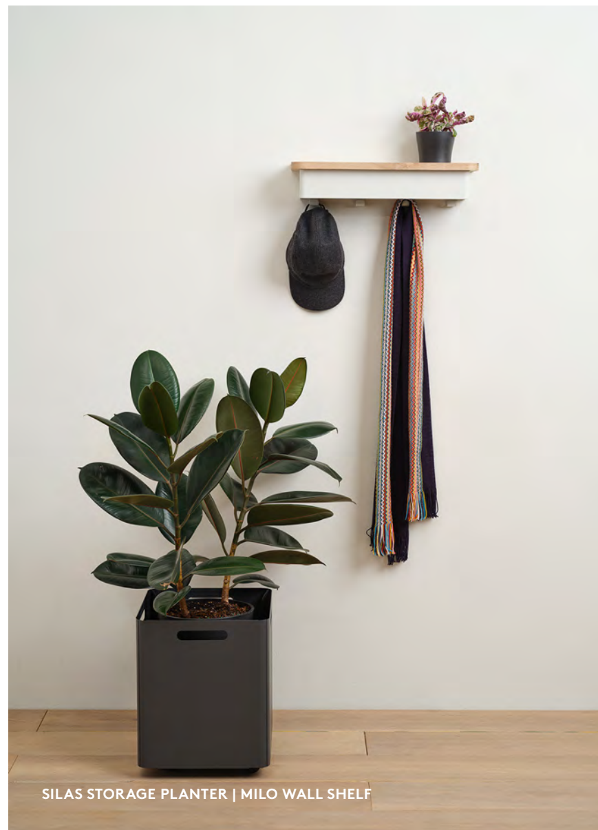
SILAS STORAGE PLANTER | MILO WALL SHELF