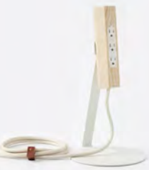
NIKO FS