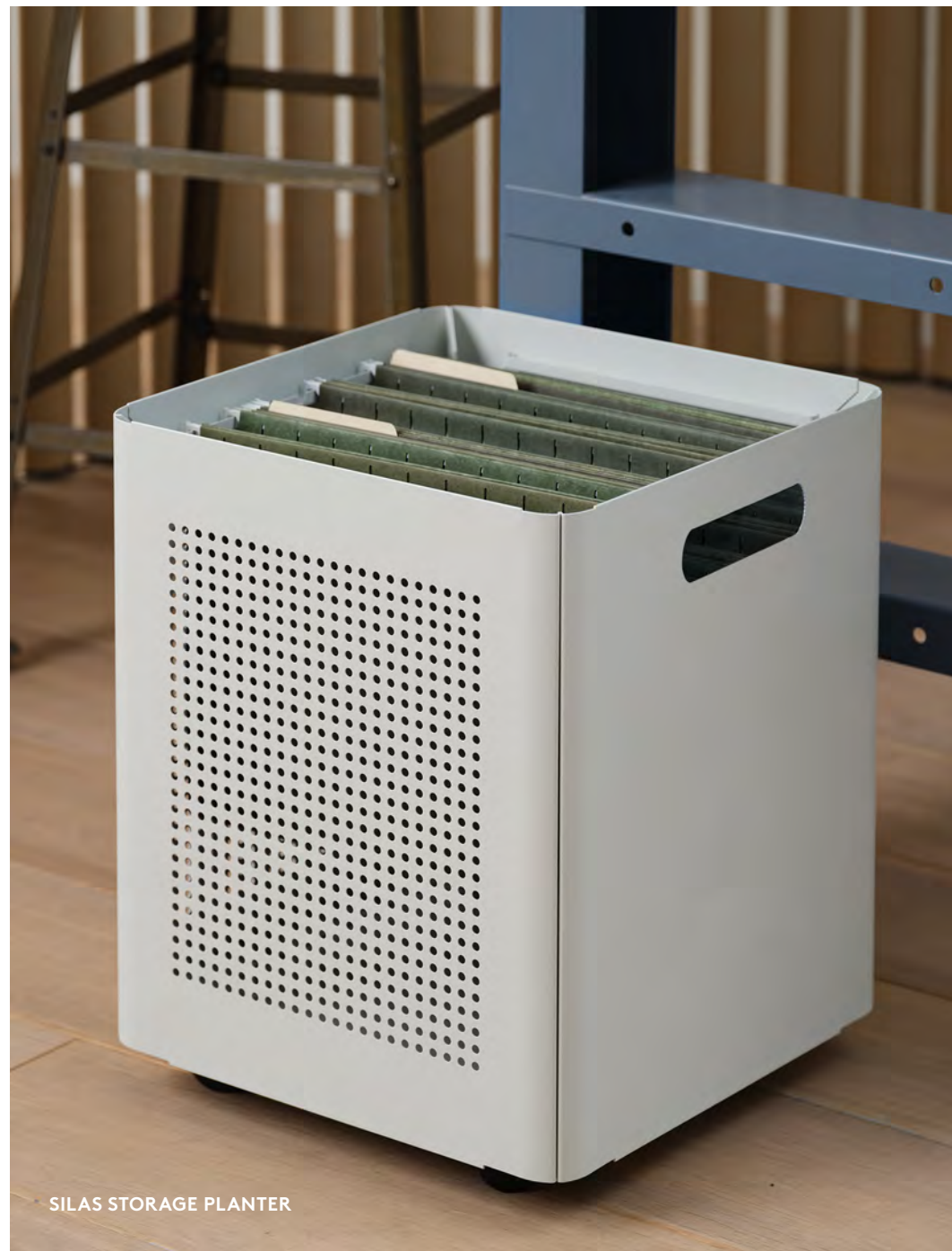
SILAS STORAGE PLANTER