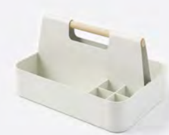
ELIN by Justin Champaign

See our entire collection of craft-inspired goods as well as specification info, image galleries and more at LightCorp.com/MostModest .