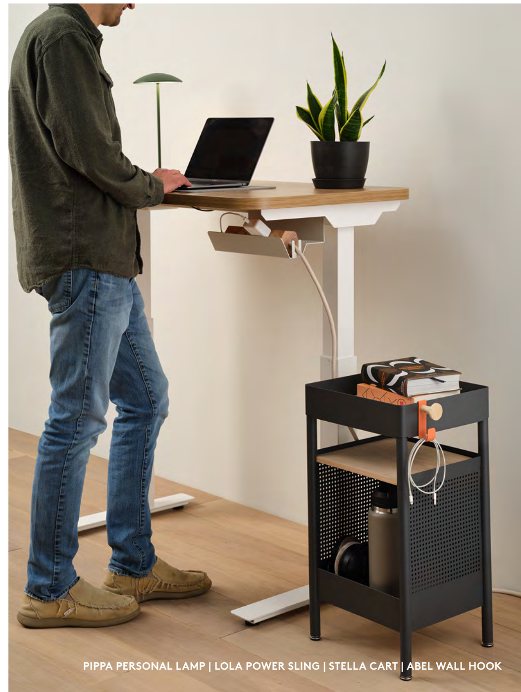
PIPPA PERSONAL LAMP | LOLA POWER SLING | STELLA CART | ABEL WALL HOOK