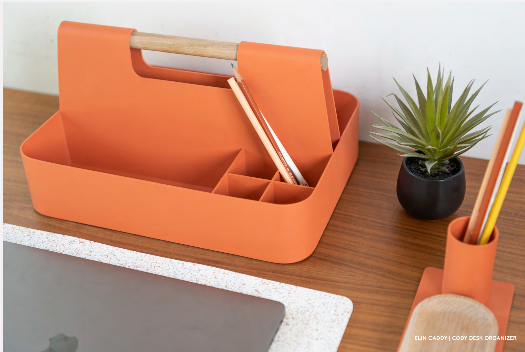
ELIN CADDY | CODY DESK ORGANIZER

Most Modest, a LightCorp brand, specializes in craft-inspired goods that help people thrive in the places they show up to work. We pull from a deep interest in behavior and a passion for making things that bring us closer to each other and our physical environments. Our products are crafted with pride in Grand Haven, Michigan.