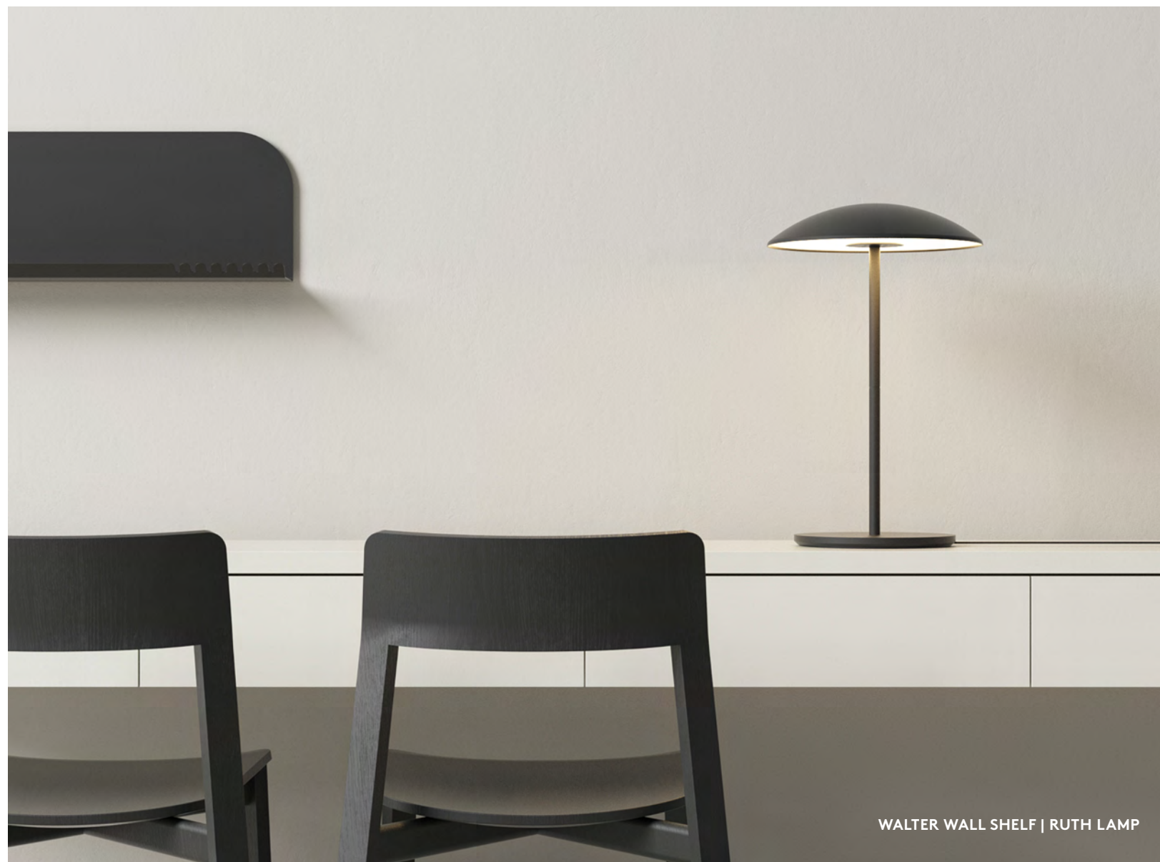
WALTER WALL SHELF | RUTH LAMP