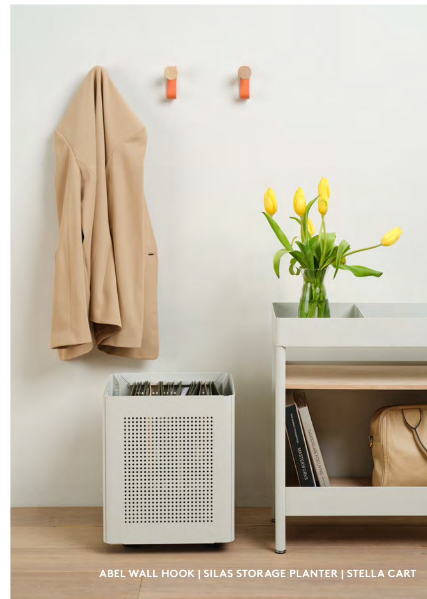
ABEL WALL HOOK | SILAS STORAGE PLANTER | STELLA CART