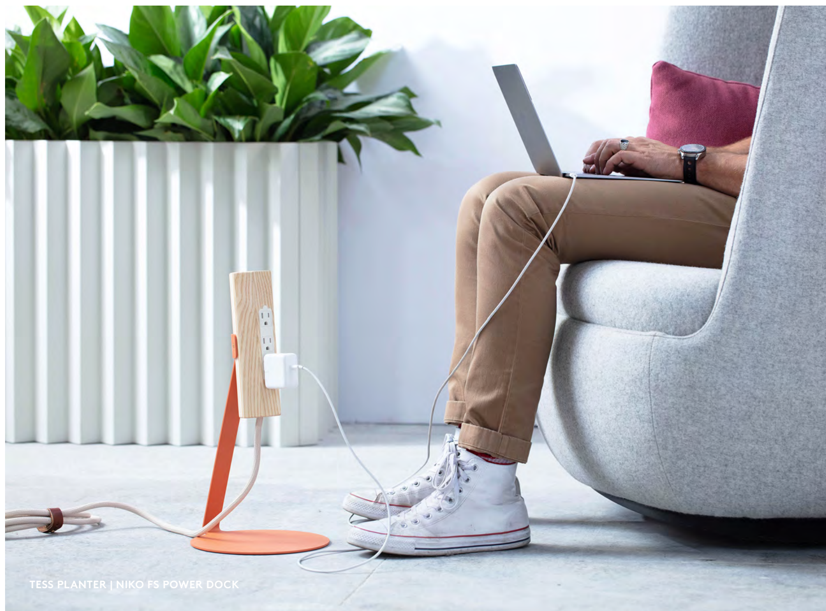
TESS PLANTER | NIKO FS POWER DOCK