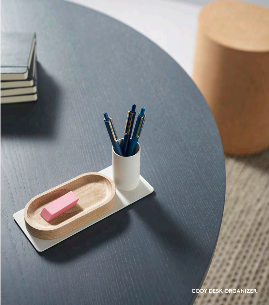
CODY DESK ORGANIZER