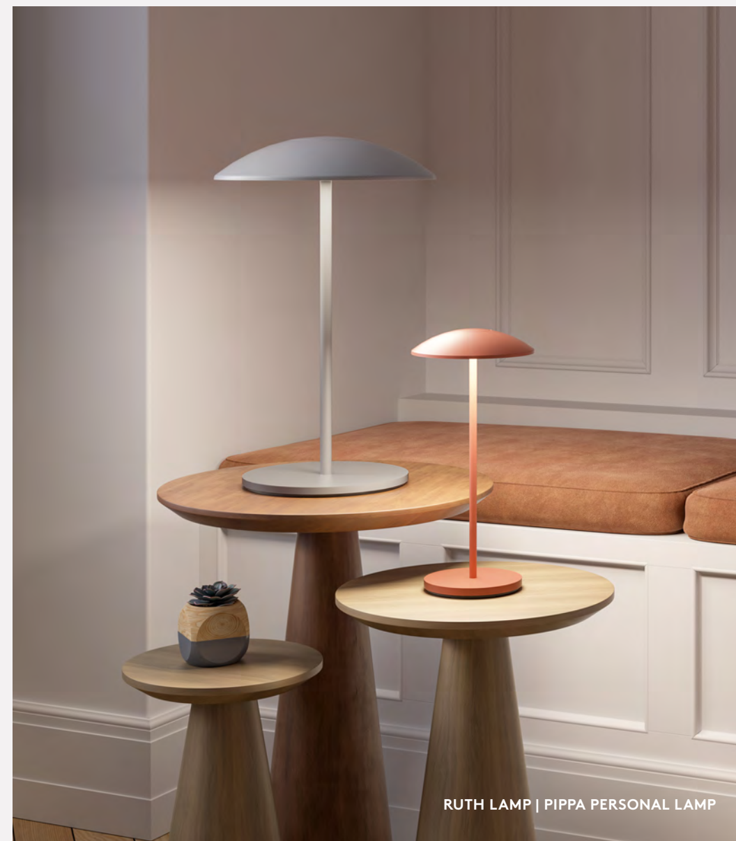
RUTH LAMP | PIPPA PERSONAL LAMP