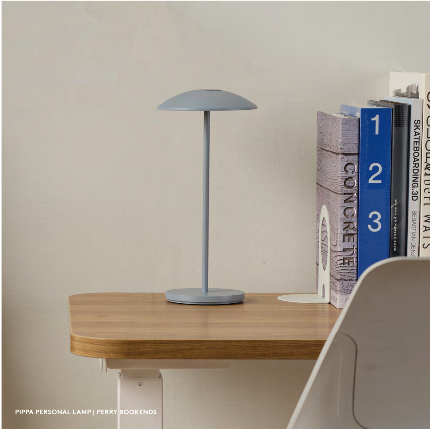
PIPPA PERSONAL LAMP | PERRY BOOKENDS