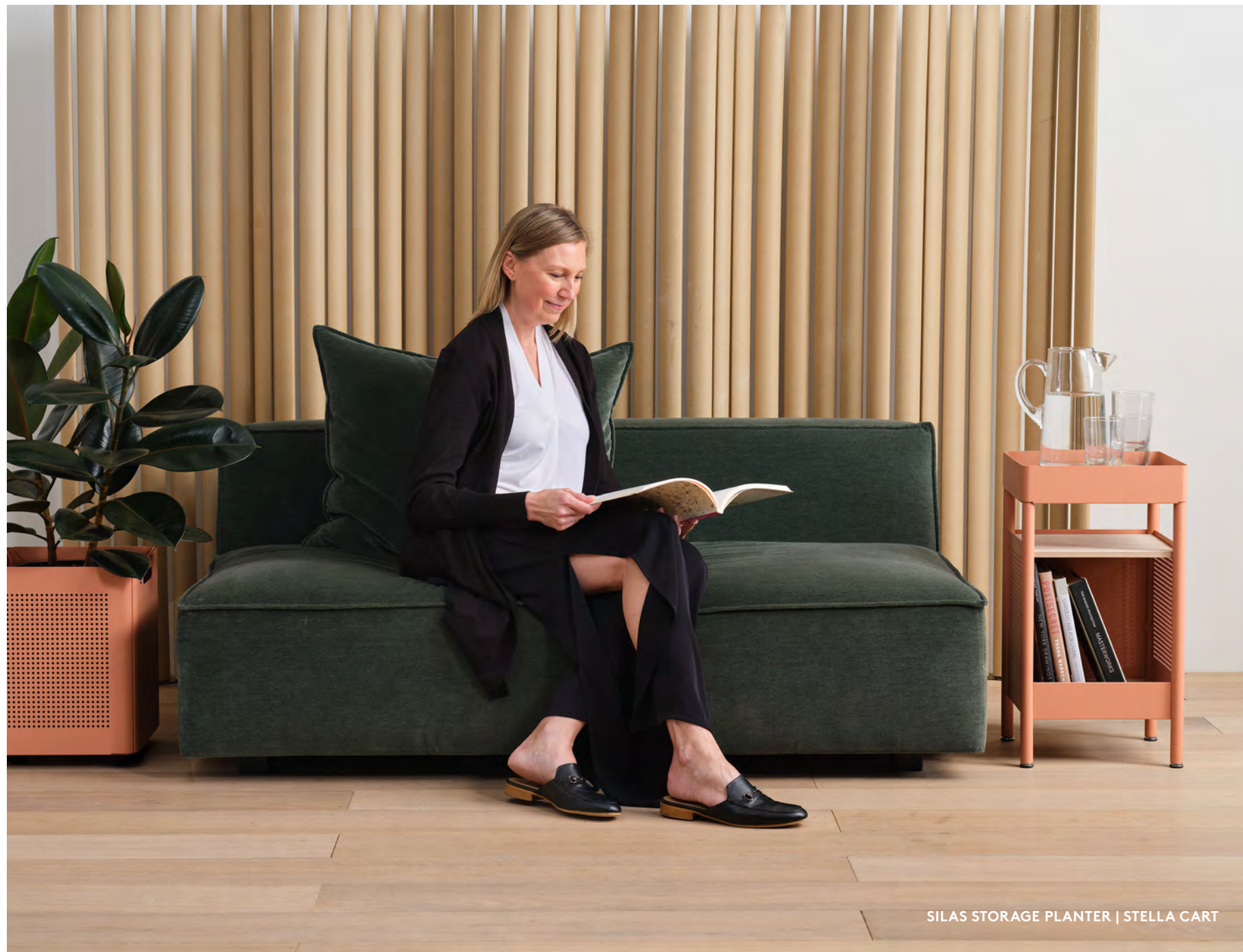
SILAS STORAGE PLANTER | STELLA CART