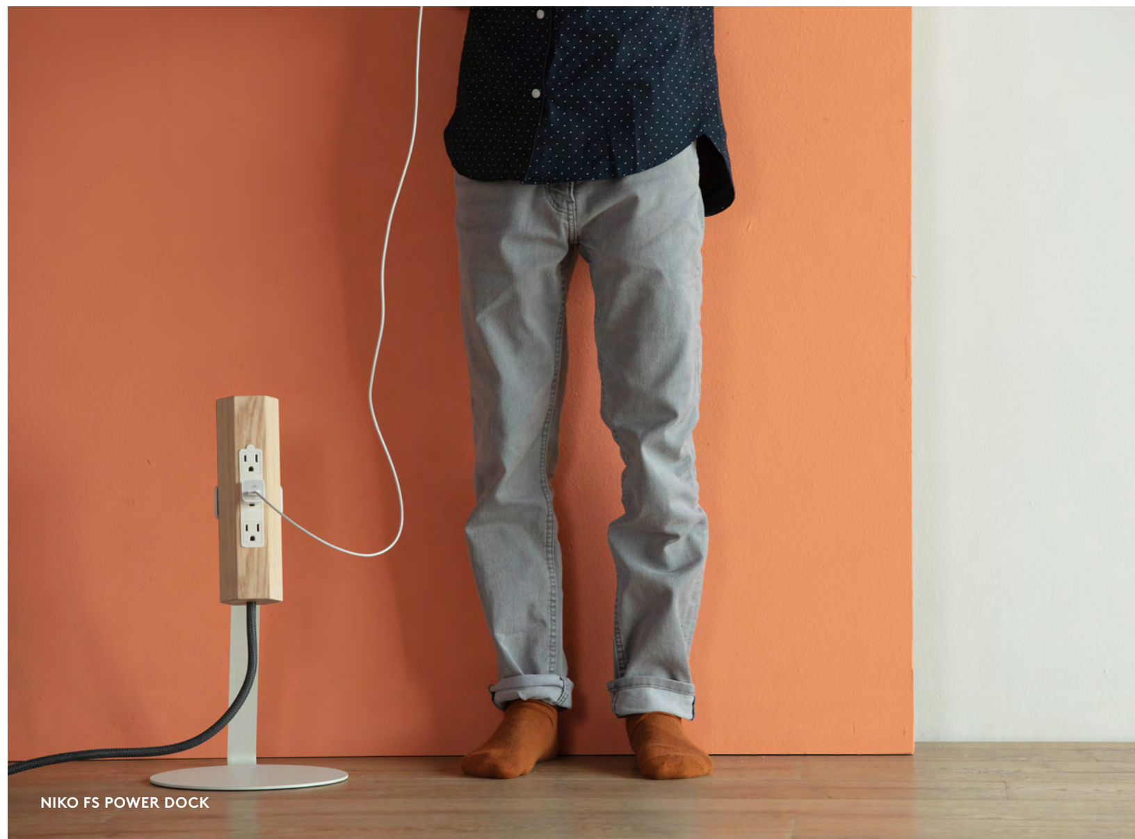
NIKO FS POWER DOCK