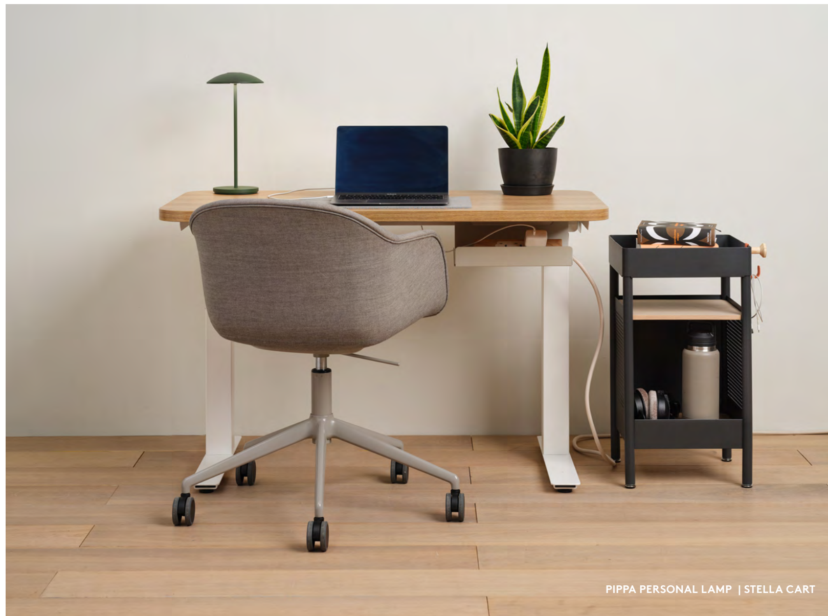
PIPPA PERSONAL LAMP | STELLA CART