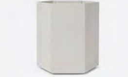
BEA