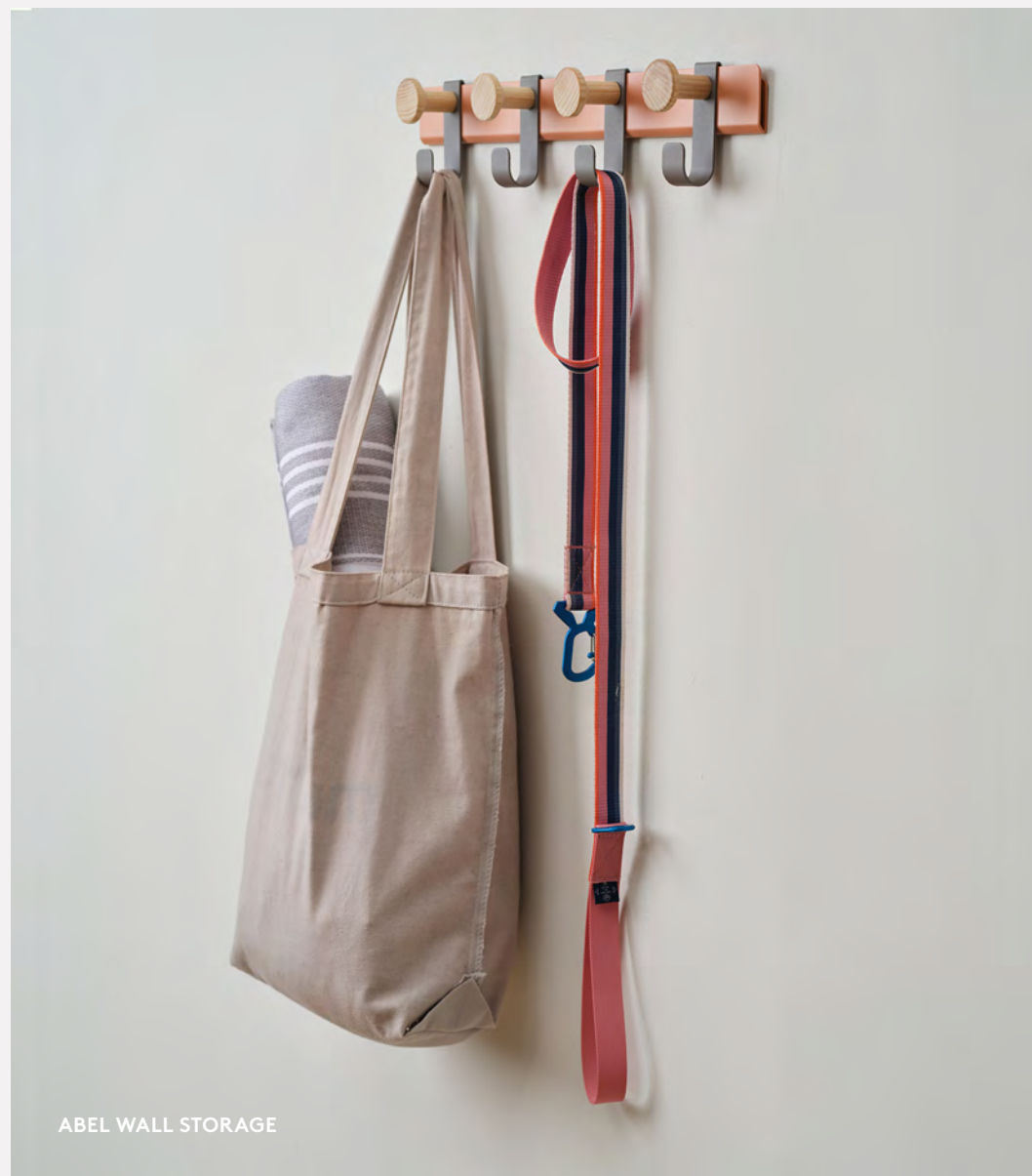
ABEL WALL STORAGE