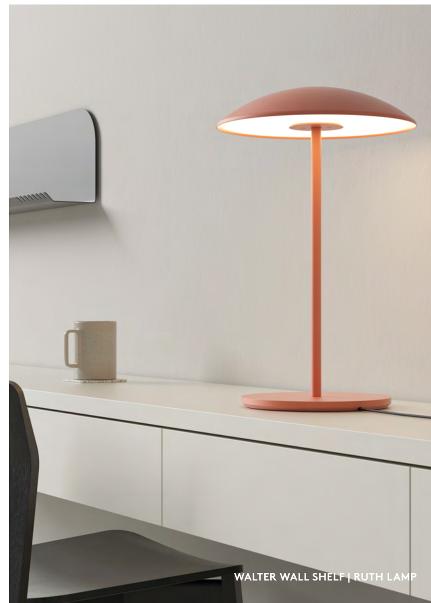
WALTER WALL SHELF | RUTH LAMP