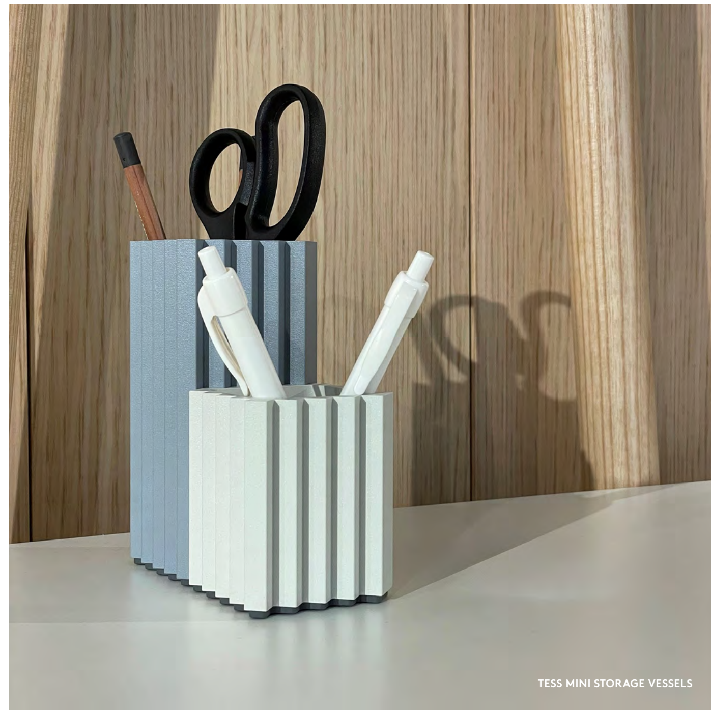
TESS MINI STORAGE VESSELS