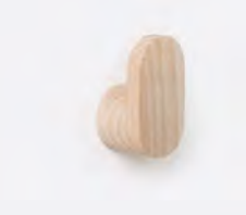
CARMEN by Justin Champaign

Explore the entire collection of our craft-inspired goods as well as specification info, image galleries and more at LightCorp.com/MostModest .